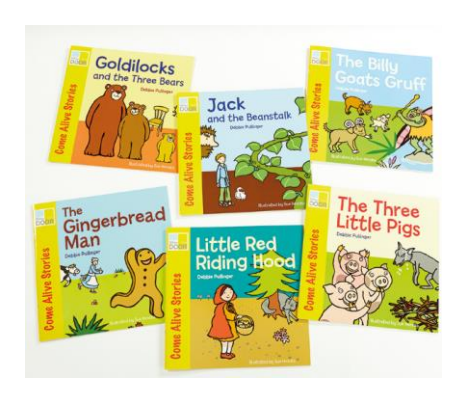
Summer Term 1 Bulletin 23rd May 2022 Topic: Traditional Tales